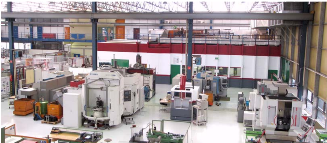
Figure 2: Research lab at PTW.

These five contributions give a good overview of the research activities in the field of machine tools and technology making full use of the PTW lab, which is equipped with newest machine tools and measuring devices (see Figure 2). The main focus of all papers are advanced machining technologies, which has been the strategic orientation of the PTW ever since.